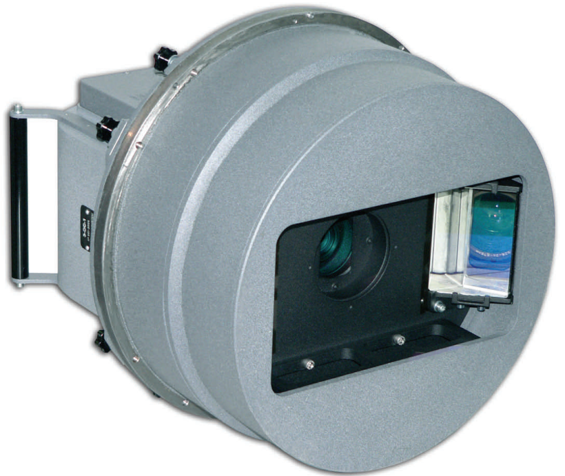
3-OC WITH MASS COMPENSATOR & 45° PRISMS