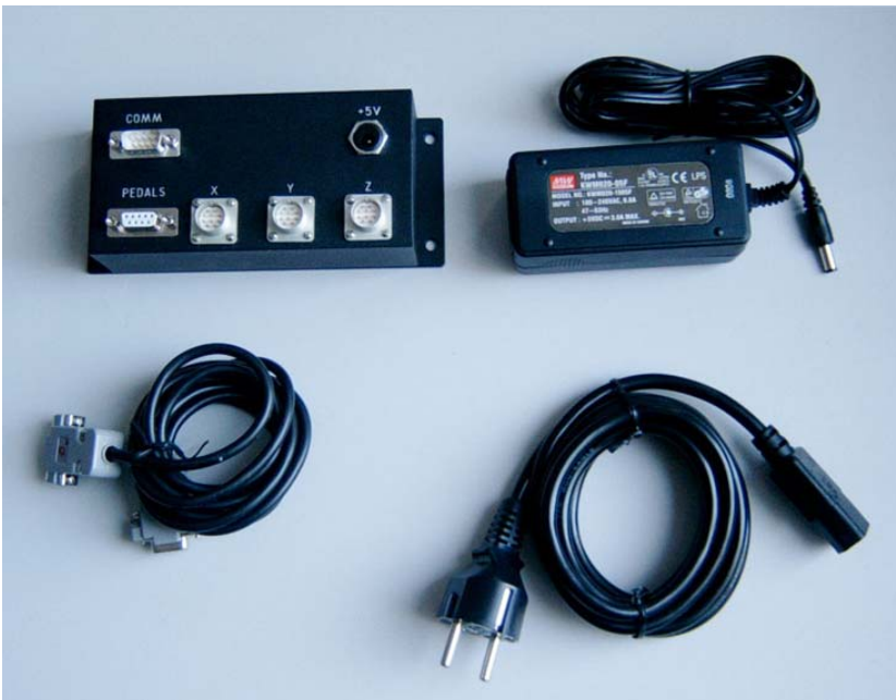
Interface unit with power source